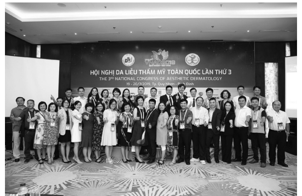
Organizers taking pictures with speakers and delegates.